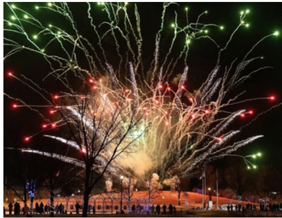
Fireworks at Independence Park