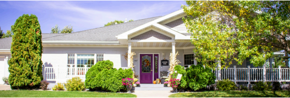
Lockwood Hospice House