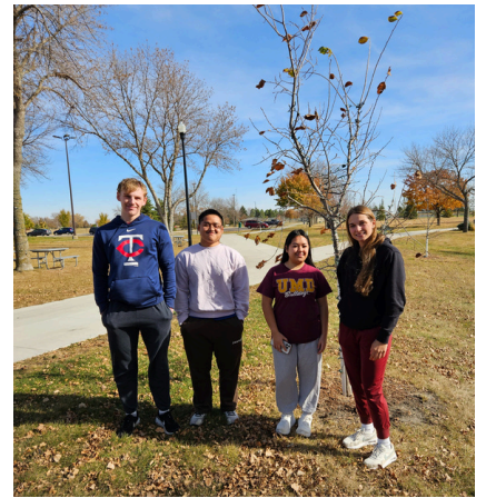
Students of the MHS Honor Society participated in decorating the park.

Light Up The Night Community Event kicked off on November 29th and continued through January 1st. We had several great weekends with great attendance due to decent weather. There is so much volunteerism that goes into getting this event ready for the community to enjoy. Decorating the park logged over 320 hours of volunteers hanging lights from Oct 6th to kickoff night. Event night volunteerism logged 165 hours. That is a lot of volunteers needed to create the beautiful park for the community to enjoy. Thank you to all the volunteers that participated this year. We cannot express how grateful we are for your assistance.