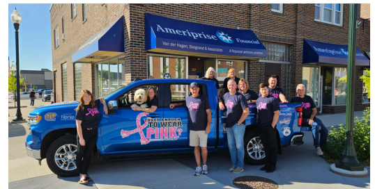
Thank you to our Tough Enough To Wear Pink Sponsors for 2024. Pictured is the staff from Vanderhagen, Skogrand, & Associates - Ameriprise Financial