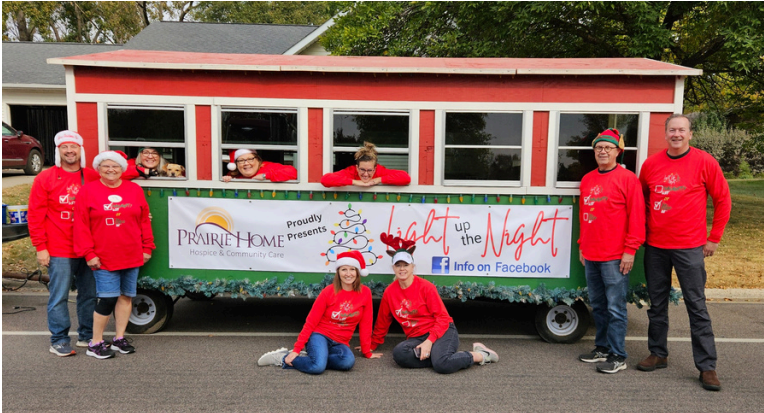
Staff, Board members & Volunteers participated in the SMSU Homecoming Parade to advertise for the Light Up The Night Event.

The 26th Annual Johnny Tilleman's Cook-Off was held on September 9th in Minneota as part of the Bug Days Celebration. It was a great event, and the group donated $1500 to Prairie Home Hospice & Community Care. There were 10 competitors and awards were given based on judge's choice, people's choice, and best decorated table.