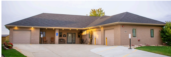
McLaughlin Hospice House