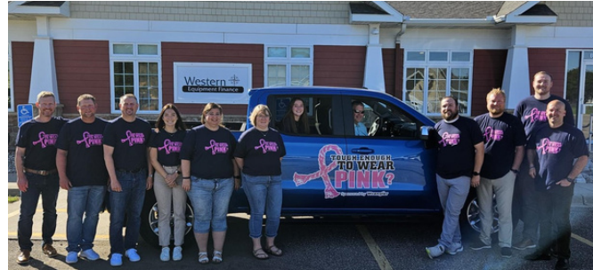
Thank you to our Tough Enough To Wear Pink Sponsors for 2024. Pictured is the staff from Western Equipment Finance