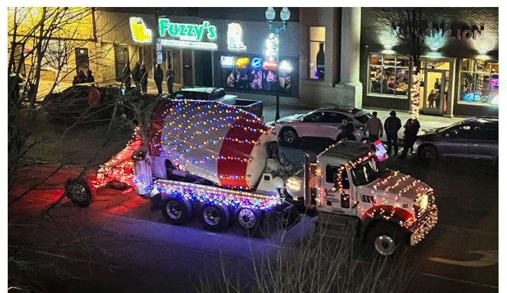
Buffalo Ridge Concrete won 1st place with this entry in our Parade of Lights down East College Dr