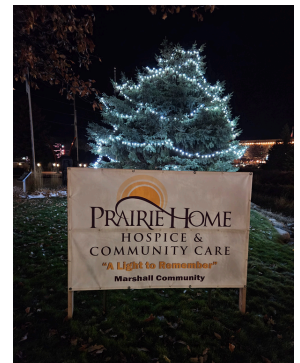
Marshall's LTR Tree