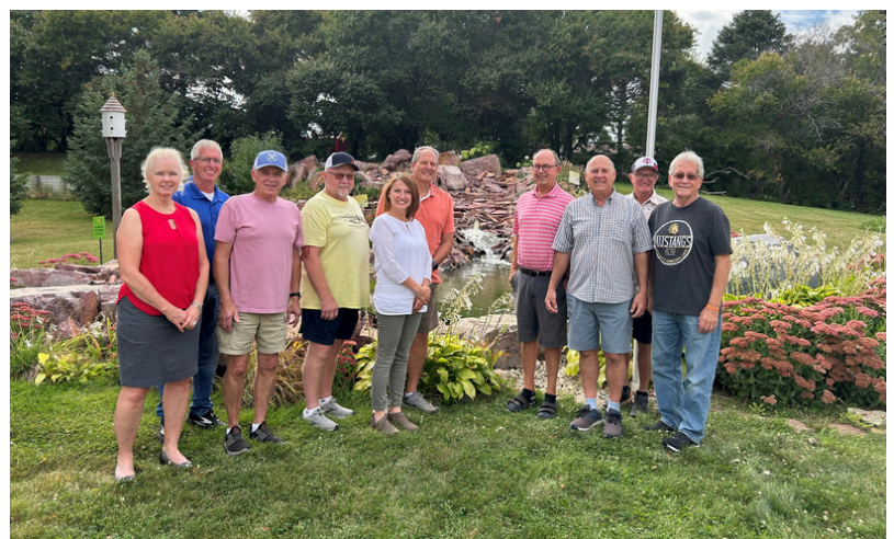
Thank you to our pond/lawn volunteer crew. We are so appreciative of all the volunteer time they provide to keep the house and office grounds and our pond in tip-top shape.