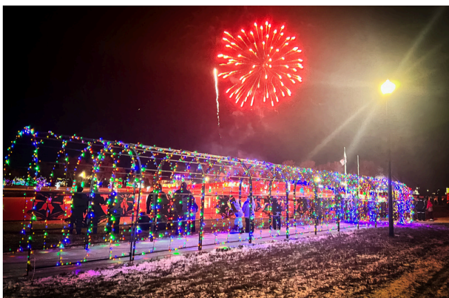
Fireworks over the arches

Light Up The Night Community Event kicked off on November 29th and continued through January 1st. We had several great weekends with great attendance due to decent weather. There is so much volunteerism that goes into getting this event ready for the community to enjoy. Decorating the park logged over 320 hours of volunteers hanging lights from Oct 6th to kickoff night. Event night volunteerism logged 165 hours. That is a lot of volunteers needed to create the beautiful park for the community to enjoy. Thank you to all the volunteers that participated this year. We cannot express how grateful we are for your assistance.