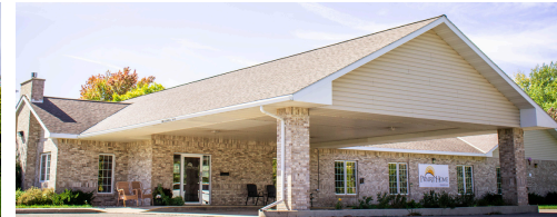
Fieldcrest Assisted Living